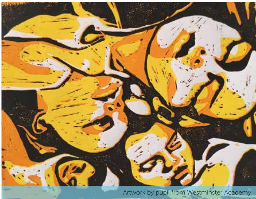
Artwork by pupil from Westminster Academy

Banding test: Saturday 9th December, 9.30 – 11am